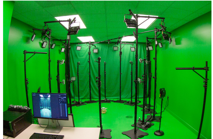
In Providence's UPmmersiv Studio, an Intel-powered Evercoast workstation equipped with Intel® Xeon® processors is connected to 20 RGB-D cameras. The depth-sensing cameras provide the ability to only accept video from within the capture ring, which is about seven and a half feet in diameter. Each camera captures a different angle of the actor.

In this app, called Responding to Microaggressions in the Workplace, learners use their smartphone camera to place a virtual hologram of a person in their room. Next, they choose a scenario and are confronted by a virtual hologram of a person who demonstrates a microaggression. Learners choose how to respond, and then the scene continues. When the scene finishes, a video of a facilitator provides feedback on their response. Learners can repeat the scene and choose a different response or select another scene.