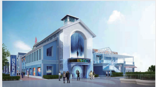
Figure 6. Shanghai Disneytown SoReal XR Space

In its Disneytown project, SoReal adopted the XiaoGu Technology smart park management solution based on Intel® Core™ processors, OpenVINO™ toolkit, and the CDXY Tech VR integrated media display platform to create a smart operations and management solution to empower XR theme park management, inject new vitality into consumer experience, and provide a truly immersive entertainment experience that covers all the senses.