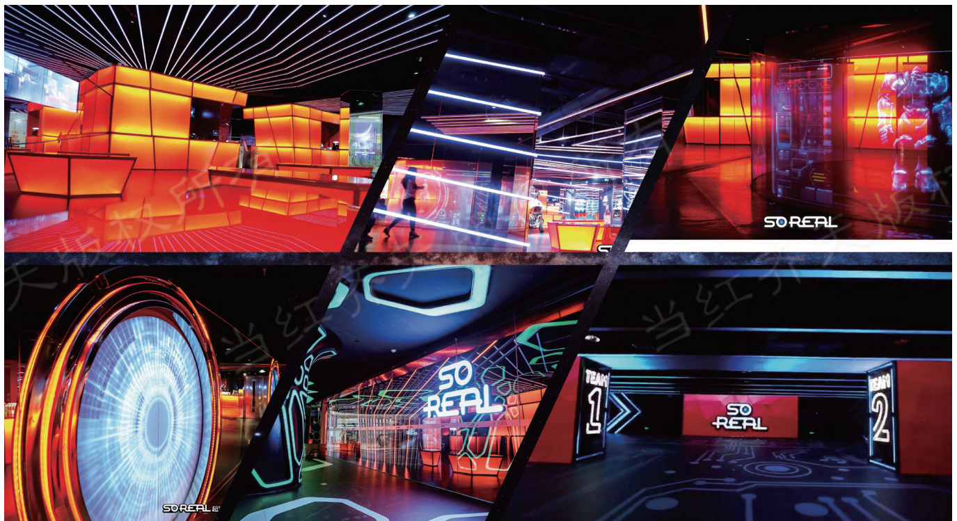
Figure 1. SoReal XR application scenarios

SoReal boasts rich experience in the construction and operation of XR theme parks. In addition to XR games, SoReal has also designed a wealth of XR interactive content. SoReal has developed multiple XR interactive experience areas, each of which has its own