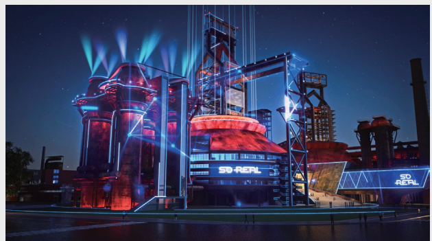
Figure 5. Shougang No. 1 Blast Furnace Metaverse Theme Park

on Intel® Core™ processors and OpenVINO™ toolkit to empower the intelligence of XR theme park management, providing an immersive, comprehensive, and enhanced consumer experience. The intelligent transformation of management saves time for consumers, cuts down on the time-consuming queuing process, and provides experience with a modern feel.