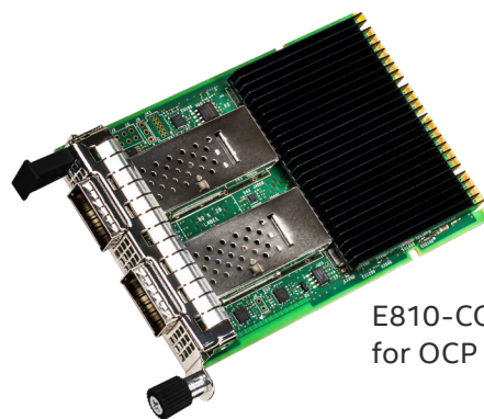
E810-CQDA2 for OCP 3.0

EPCT can program adapters to act as many different physical adapters